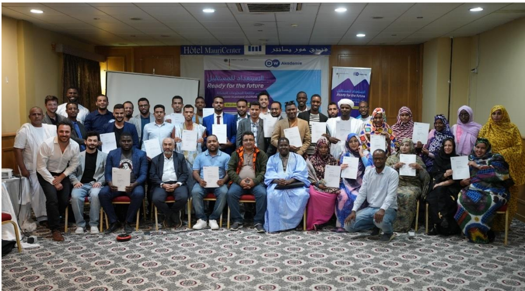
Group photo after conclusion of the workshop “Ready for the Future”: An Explorer Lab, 19 th December 2024, Mauritania.

Workshops were conducted to discuss challenges and opportunities that exist in the media landscape of Mauritania, especially regarding disinformation. The paper provides an overview of the media landscape in Mauritania, presenting key issues related to disinformation. It concludes with recommendations on actionable next steps through which Mauritania can strengthen its resilience against disinformation and support a more informed and engaged citizenry.