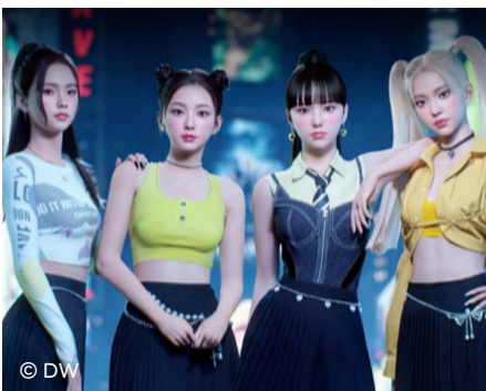
The AI-generated girl group "Mave" from South Korea