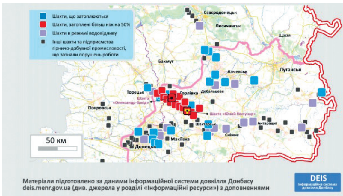
Mining industry facilities in the region. 9

are therefore potentially dangerous facilities (high-risk facilities, according to the legal definition) 10 . The performance indicators of the mines show significant changes resulting from the armed conflict. It should be noted that the situation in regard to mines not under government control is not well known, as there is no access to the facilities themselves, and any information has to be obtained from open sources of the relevant “official” bodies or from relevant groups of social network users. Thus, the data on objects in the non-government-controlled territory contained in this report may at times not coincide with factual data. The table below gives an overview of the situation in relation to the mines of the Donetsk and