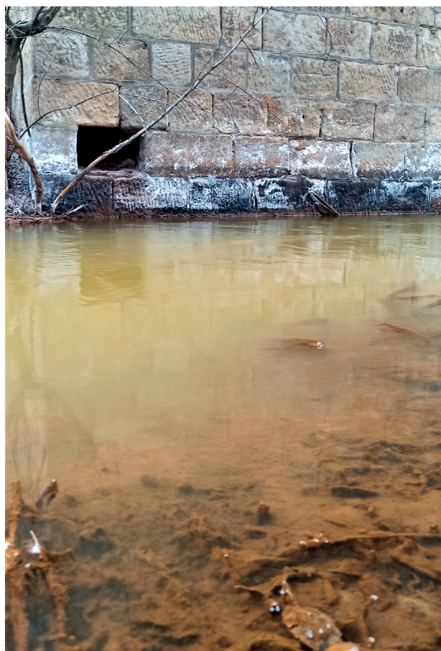
Komyshuvakha River, village of Zolote, Luhansk region. Photo by Truth Hounds, April 7, 2021