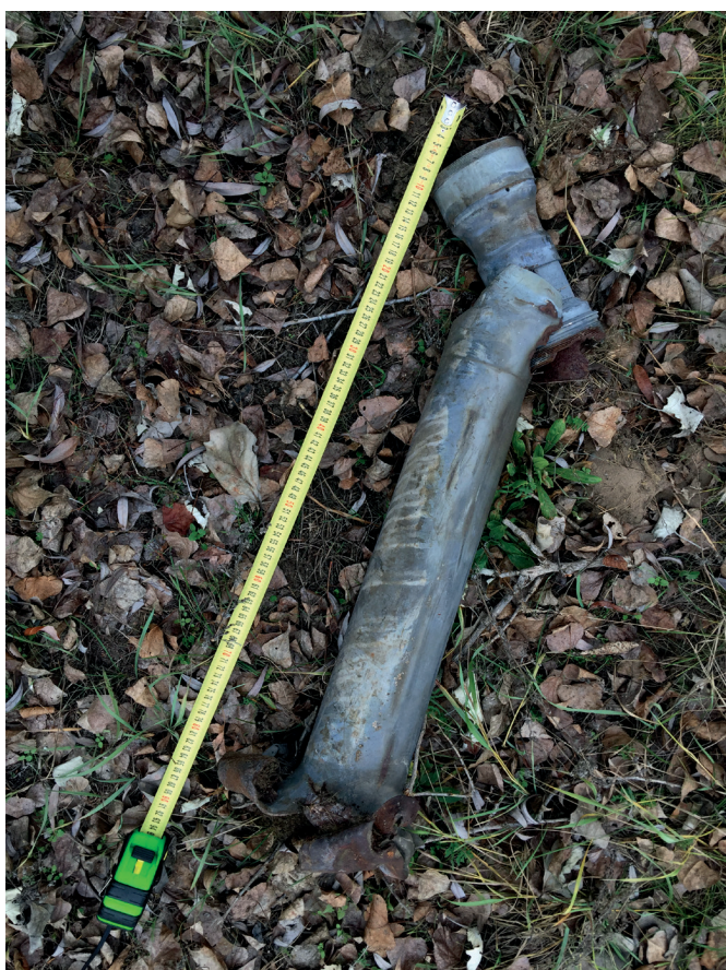
A shell from a BM-21 “Grad”, which destroyed the earth dam near the village of Nyzhnia Vilkhova in February 2015. Photo by Truth Hounds, November 2019.

hit one of the earth dams was filled with bags of earth, which are almost at the water level and seep into the water. Downstream, below the dam, there is a pool of water, the area around which is densely built up with the houses of the residents of Vilkhova. In the event of a dam breach, several dozen households will be flooded.