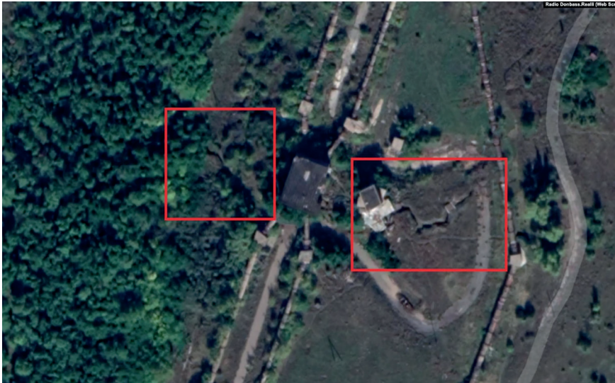
Satellite image of the pumping station near the village of Shumy. Trenches nearby are clearly visible, which are likely to be fortifications of illegal armed groups.

The last recorded shelling of a water supply facility took place on April 6, 2021, resulting in the loss of power to the pumping station of the first elevation of the “Pivdenodonbaska” water supply, located in the “gray zone” between the villages of Vasylivka and Kruta Balka. More than 250,000 people from the Volnovaskyi and Pokrovskiyi areas of the Donetsk region were left without water. 57