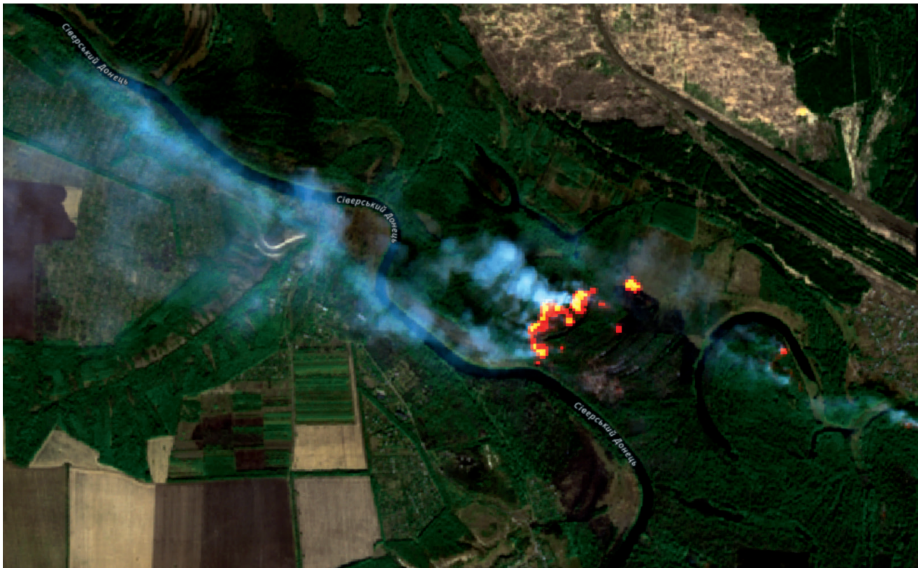
Satellite image of the fires in the Luhansk region, October 2020.

were deployed to extinguish the fires in the territories controlled by Ukraine, as well as equipment and personnel from the National Police of the Luhansk region, and the AFU.