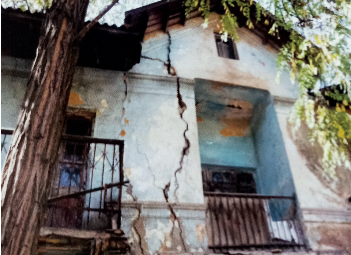
A crack in the façade of a house in the village of Pivdenne, Donetsk region.

as by international support through sporadic projects..