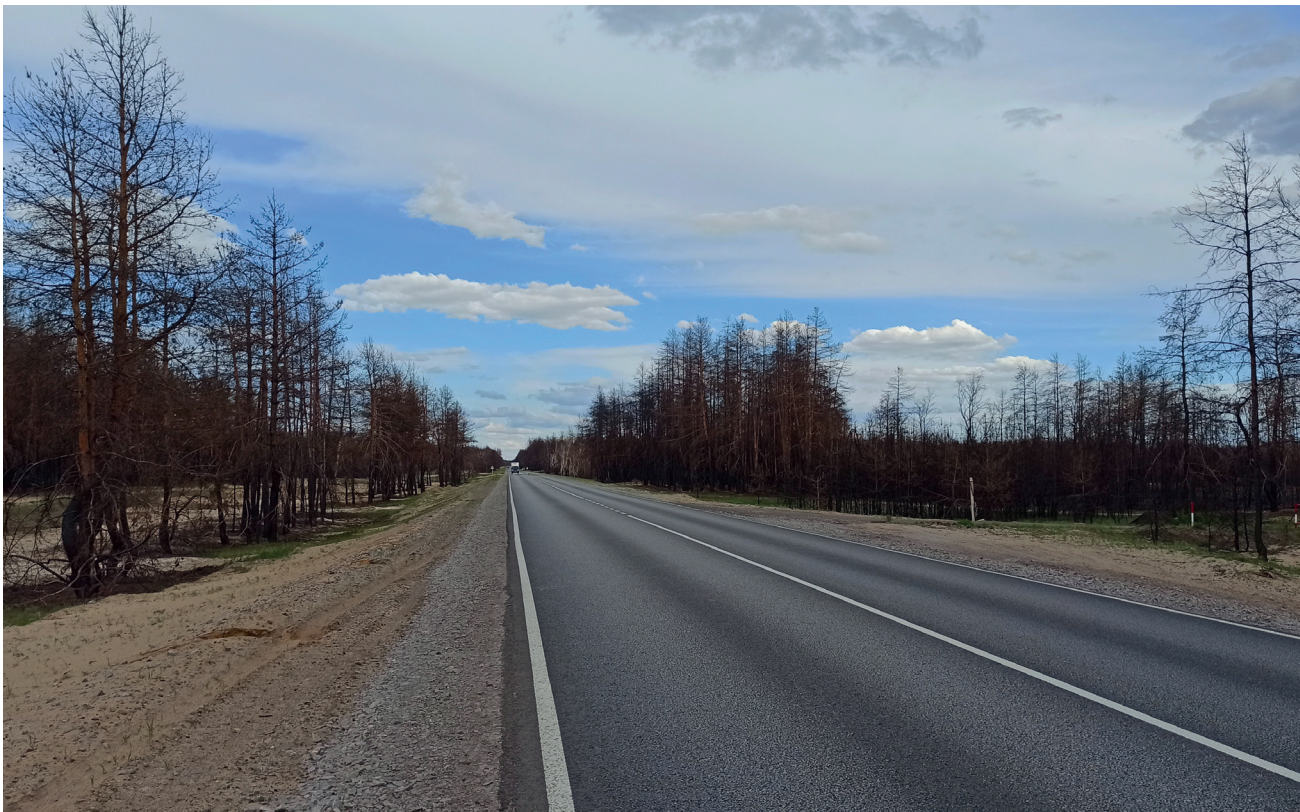
Aftermath of forest fires in 2020, Sievierodonetsk-Novaidar highway, Luhansk region. Photo by Truth Hounds, May 6, 2021

At the same time, soldiers from the 24th Mechanized Brigade, stationed in Novoluhansk (Donetsk region) additionally reported an arson attempt and their positions. 81 The location of the fire – just beyond the line of delimitation – is in favor of the theory of arson by the “LPR”, as is the absence of fires in neighboring areas, controlled by the “LPR”. The existence of landmines along the front line is also relevant here. Landmines only exacerbated the fires which were already being spread by hurricane-force dry winds.