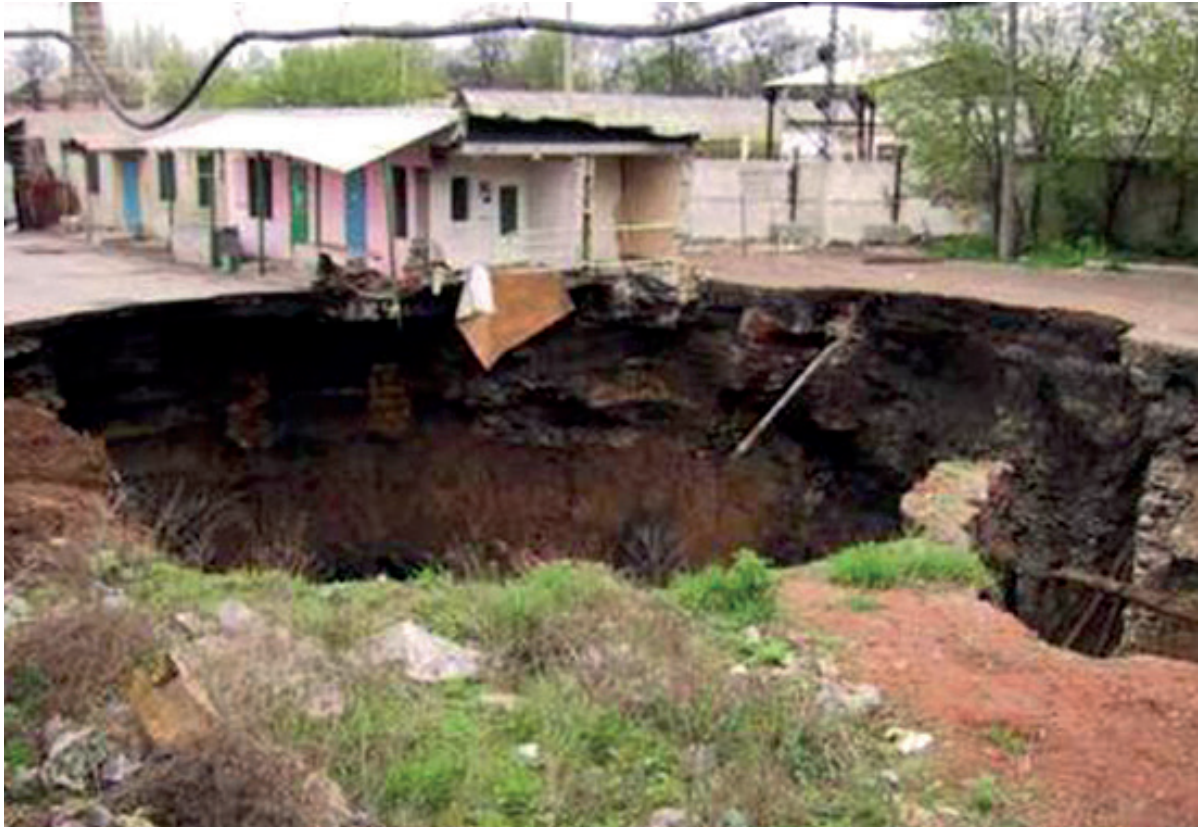
Sinkhole in Makiivka