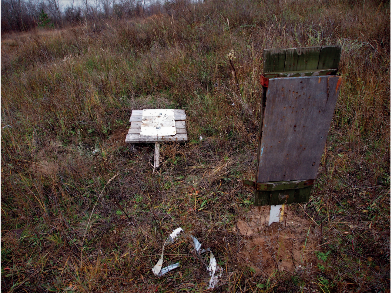
Targets left after the shootings on the territory of the «Trokhizbenskyi Steppe» reserve, photo by Truth Hounds,

The “Kreidova Flora” Nature Reserve came under fire in 2014 and 2015. Craters still remain at the sites of numerous hits, and trenches have been preserved. The reserve has now been de-mined, and it is in working order, with the natural environment starting to return to its former state. However, the condition of the soil after the shelling is still in question. The documenters sampled the soil from several craters to analyze its chemical composition. The results of the analyses reveal the presence of heavy metals, as well as an acute excess of the maximum allowable concentration of some of them, 85 and a high level of sulfate salinity (see table below). For some heavy metals, such as titanium, there is not even any set maximum allowable concentration, as they should not be