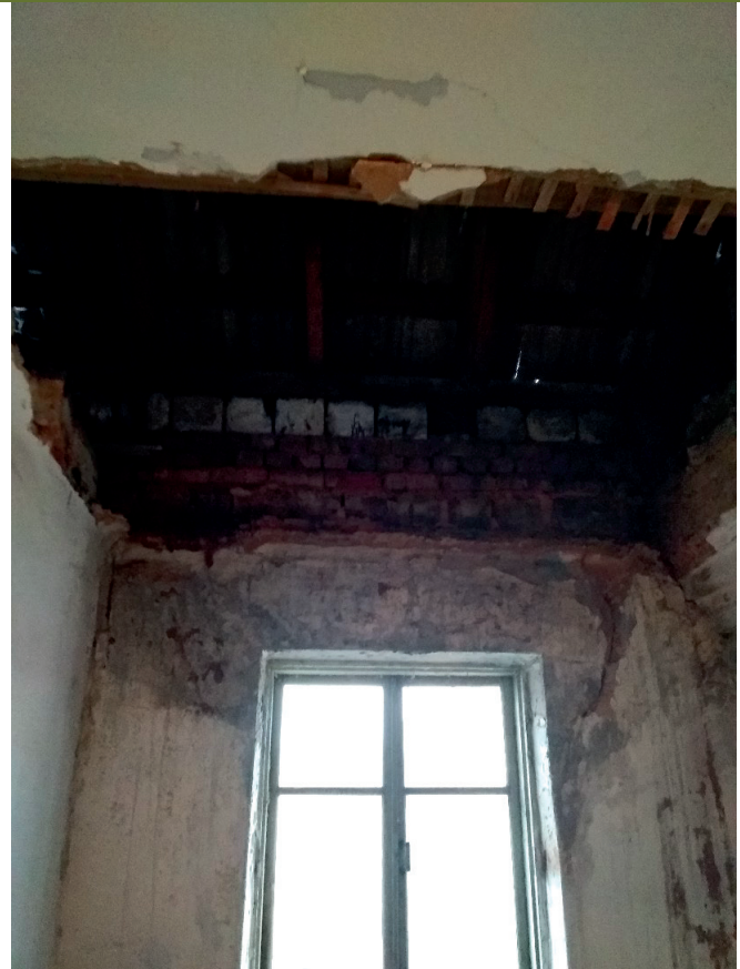
Aftermath of an earthquake in Makiivka

are in drainage or “wet conservation” mode. Local residents attribute the earthquakes to the shutting down of mines, and they complain of the lack of reaction on the part of local authorities and the deliberate silence surrounding the situation, including in the media. 37