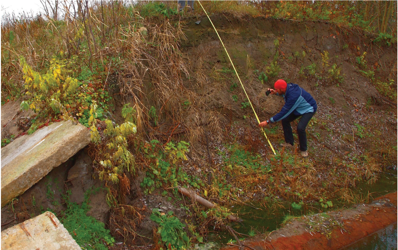
Destroyed dam near the village of Nyzhnia Vilkhova, photo by Truth Hounds, 2019