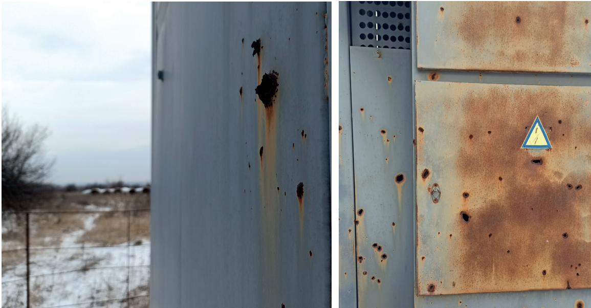
Aftermath of the shelling of the “Hirska” pumping station in February 2017. Photos by Truth Hounds, February 2017