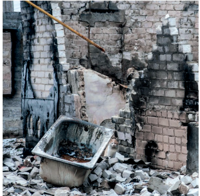
Aftermath of forest fires in 2020: Smrotyne, Voronove, Muratove, in Luhansk region. Photos by Truth Hounds, October 2020.