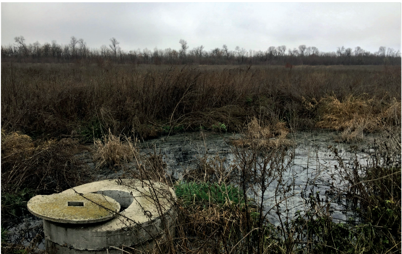
Sewage leakage from a collection site near the "Maiorske" checkpoint in November 2019.