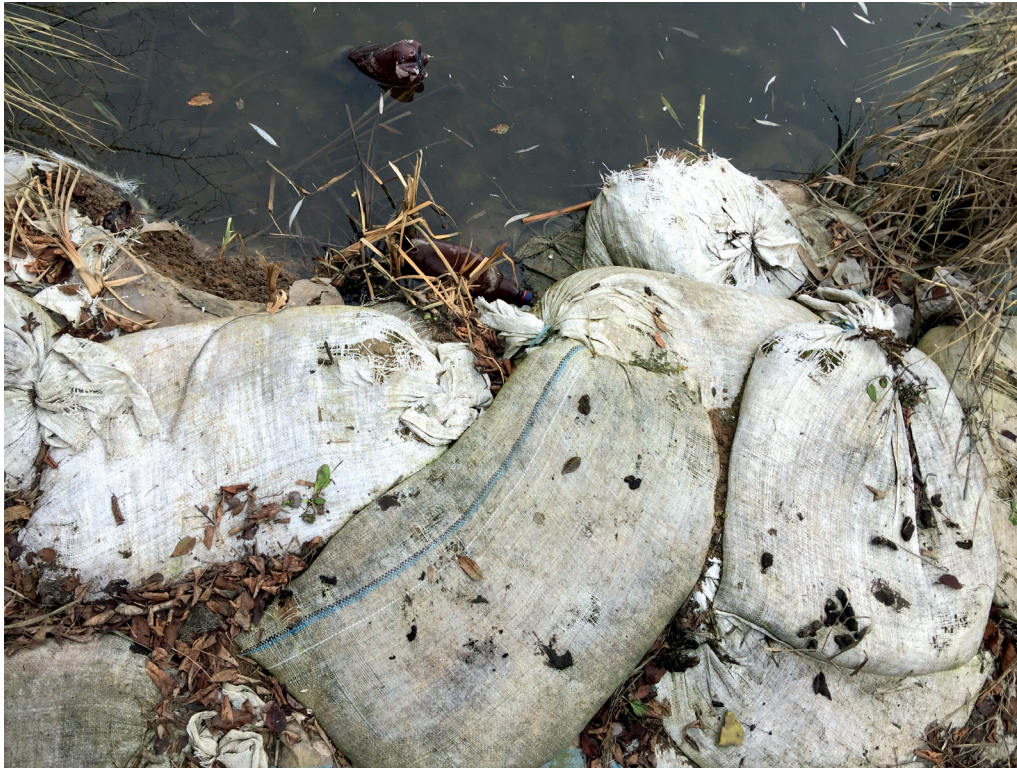
A hole in a dam near the village of Verkhnia Vilkhova, photo by Truth Hounds, November 2019.

is hazardous. Their condition threatens to pollute the natural environment with untreated wastewater, and to provoke a deterioration in the sanitary and epidemiological situation for the population. For example, sewage collection buildings near the “Maiorske” checkpoint have been abandoned and have not functioned properly since 2014. As a result, sewage masses flow directly into the “Pesky-2” reservoir, and from a natural ravine, fall on the fields. Truth Hounds documenters found a box of military ammunition, as well as cartridge cases from 7.62 AKM ammunition and the cover of a military identity card on the territory of the abandoned collection site. They also documented traces of shelling with unidentified weapons on the building from the side of non-government-controlled Horlivka. All of this indicates that military personnel have been present on the facility’s territory, turning the sewage treatment plant into a legal military target and could cause damage to them..