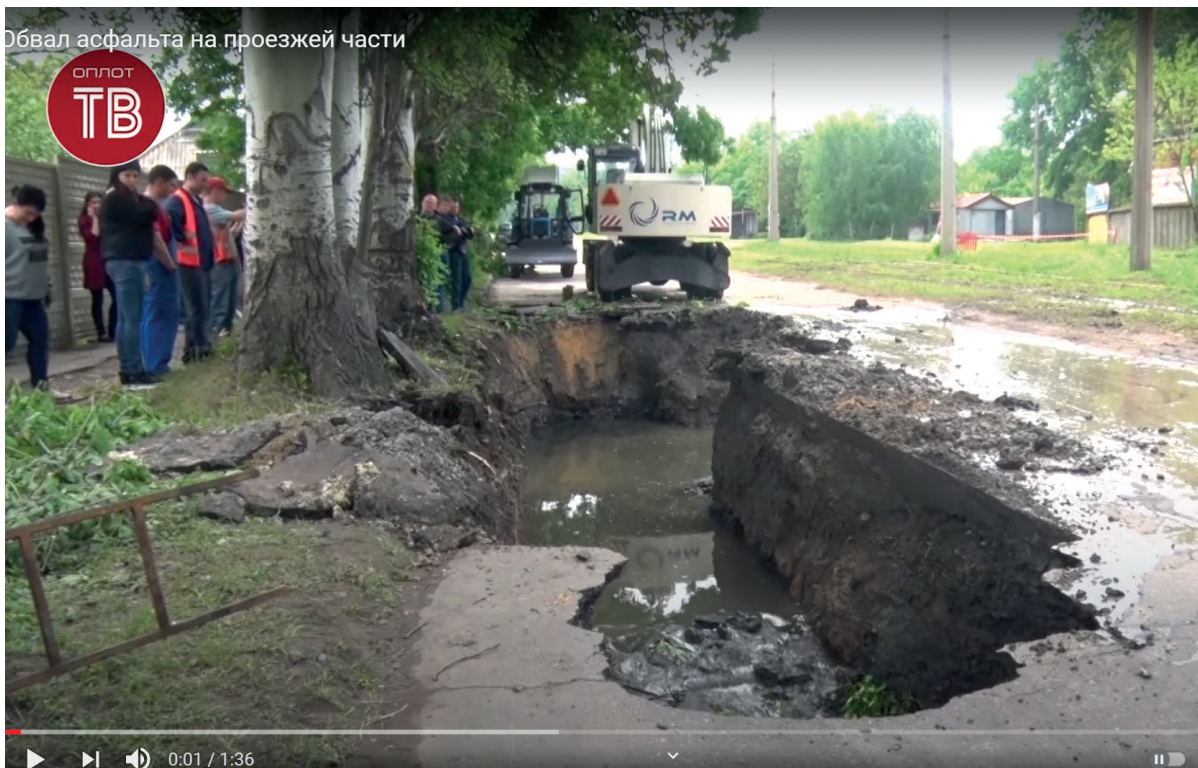
Freeze frame from material of the TV company "Oplot TV" of the so-called "DPR" from 29.05.2020 32