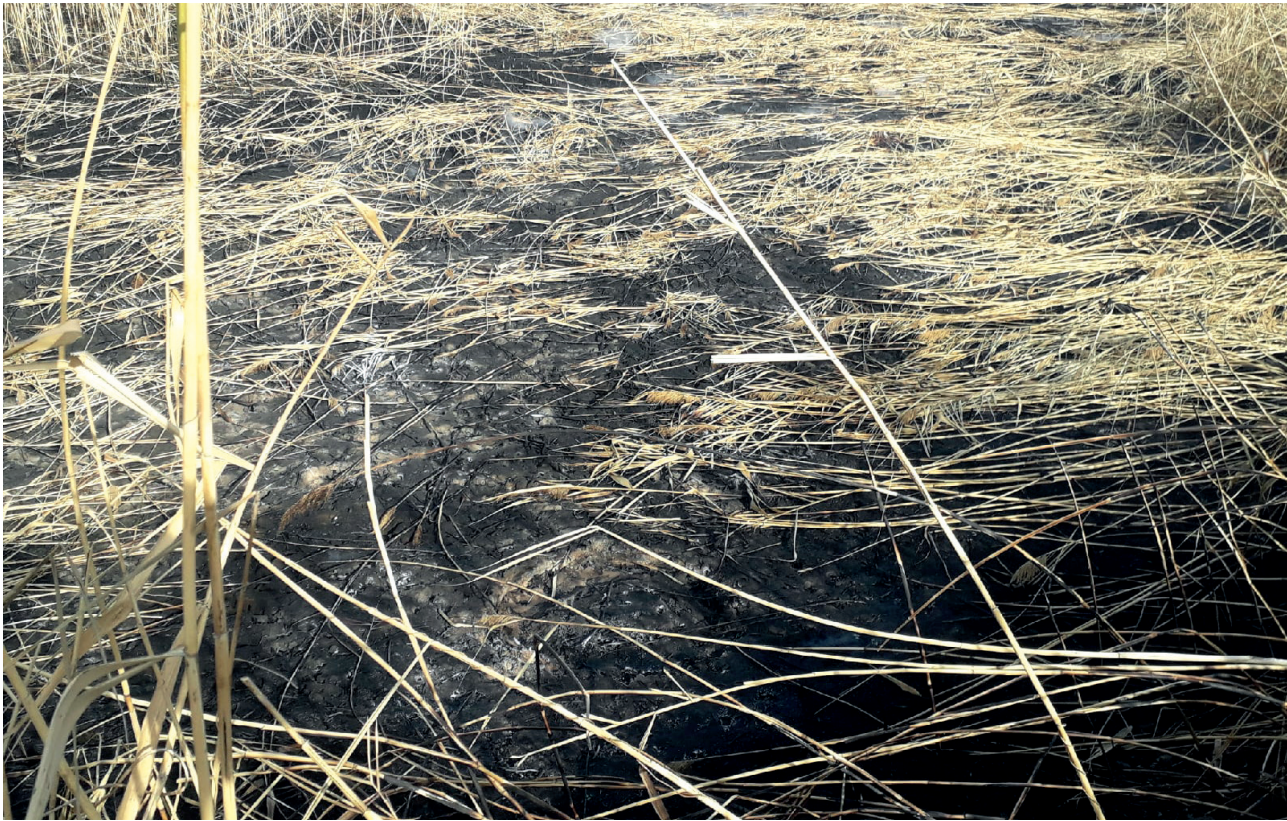
Site of underground gas leak, in Nyzhniy, Horlivka, November 4, 2020.