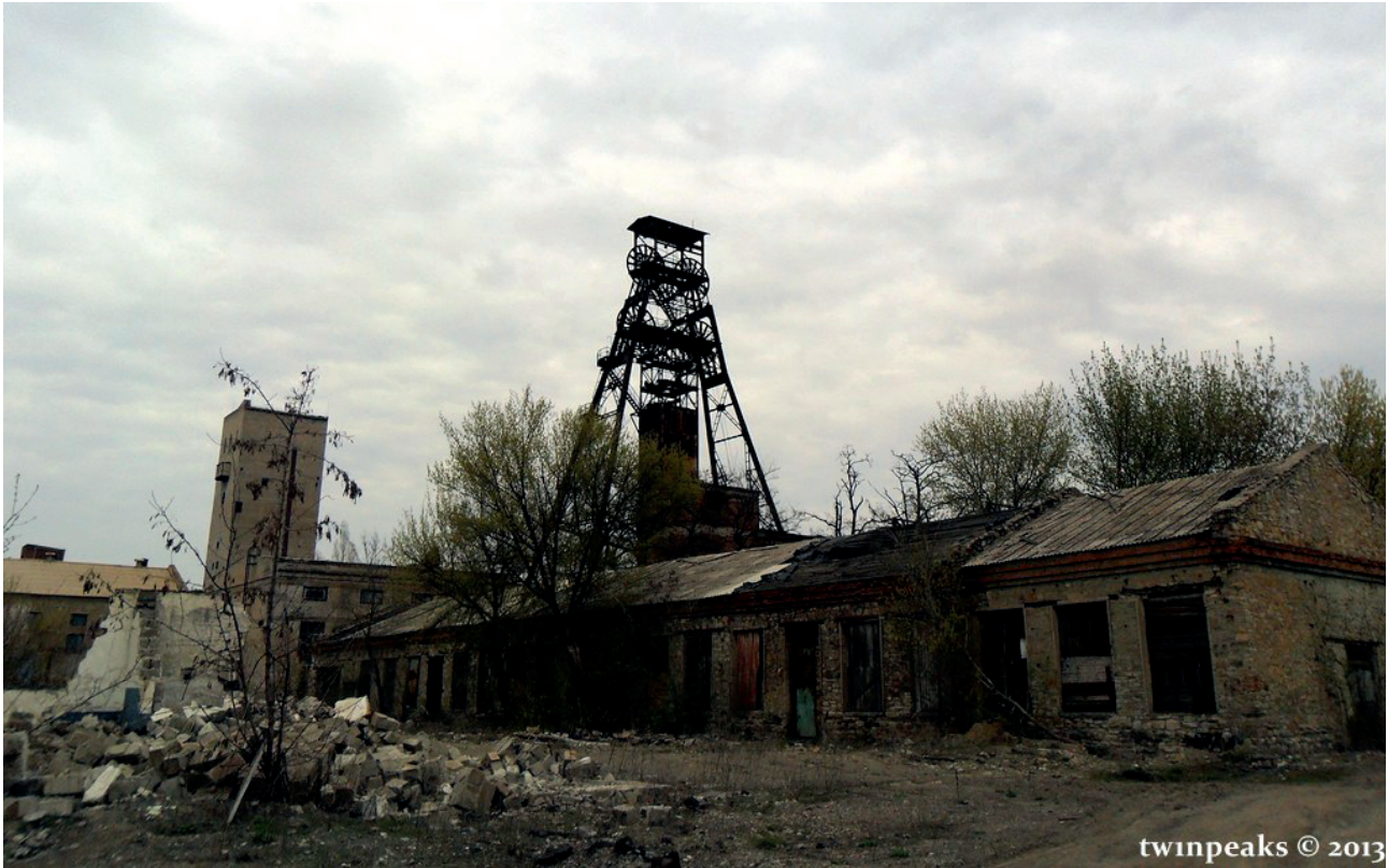
Example of mine restructuring: "From 2013 to 2021", "Artema" mine, Toretzk