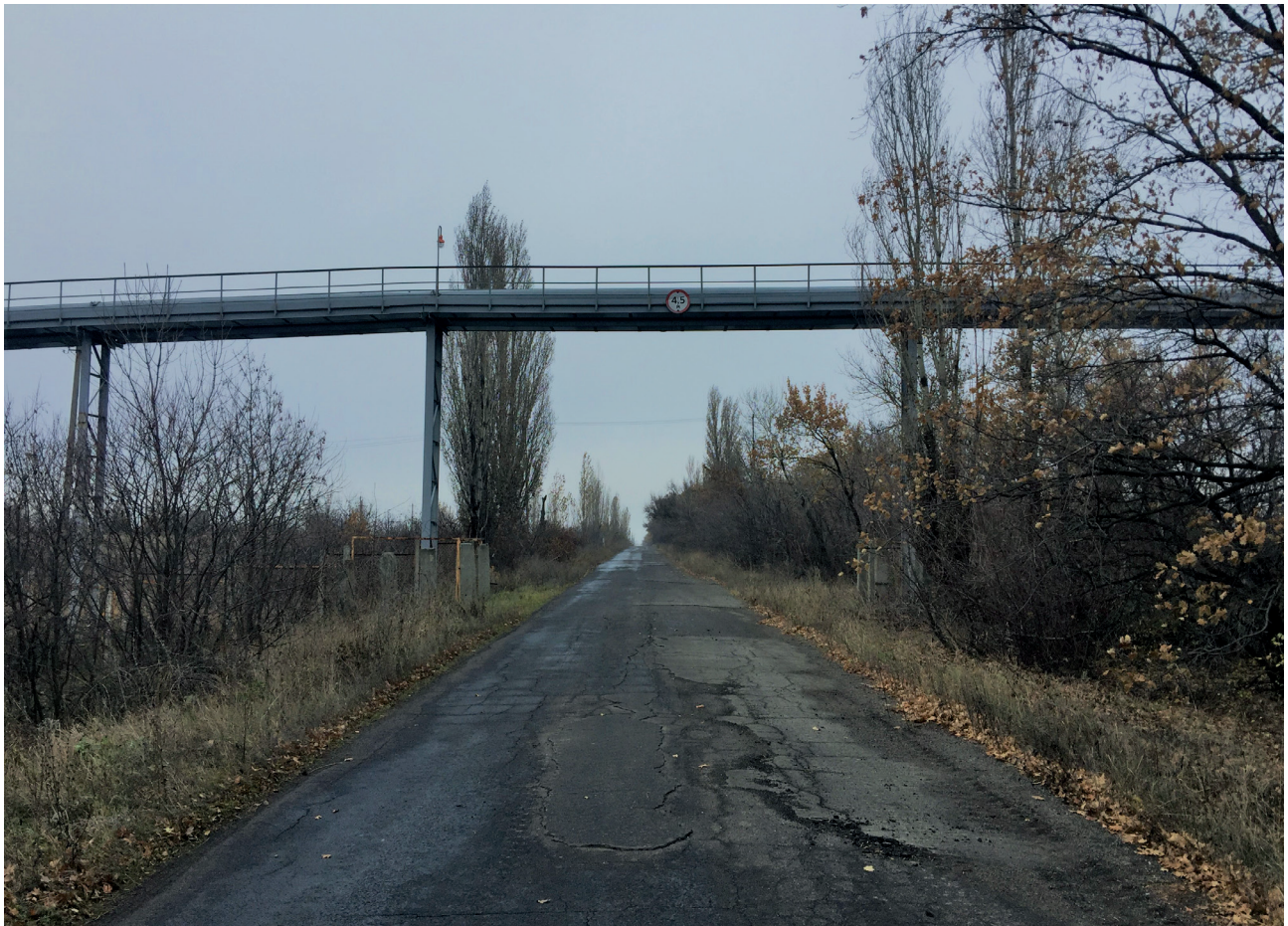
Open section of the “Toliatti-Odesa” ammonia pipeline in the Donetsk region near the “Maiorske” EEC. November 2019

ammonia pipeline passes through the territory of 8 regions of Ukraine, including Donetsk. The branch from the main pipe to the “Stirol” plan is called the Horlivka section, and it runs through the occupied territories. According to the State Emergency Service of Ukraine, the facility is bordering on safe operation. Despite the availability of automatic control systems, the risk of emergencies remains high. Since the ammonia pipeline is in close proximity to the conflict zone, there is a risk of damage from military action or sabotage.