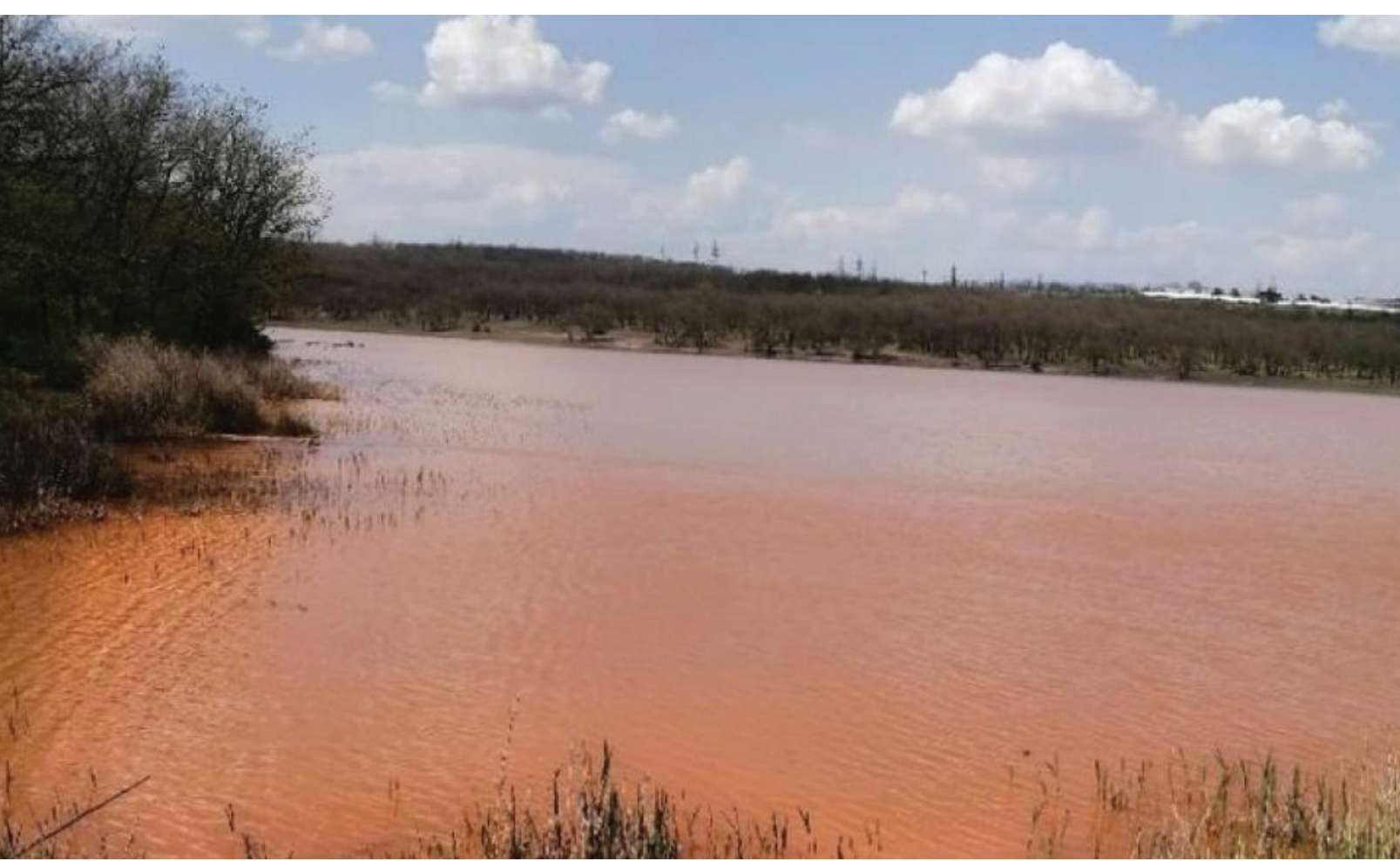
Pond near the village of Standartne after the release of groundwater from the Bulavynka mine, May 2020.

Despite the relatively proper drainage systems in these mines, the analysis of drinking water sources in the surrounding areas showed that in only 2 of the 11 sources the water meets the accepted standards. In other samples, the dry residue is significantly excessive, which indicates increased mineralization of drinking water 25 . This situation can be extrapolated to the occupied territories, while the scale of the damage should be increased, as three times more mines are operated, drained or flooded along the front line than in government-controlled territory. The catastrophic nature of the situation in regard to the release of mine water can be perceived from the state of the reservoirs of the village of Standartne, near to Yenakiiv. Residents of Yenakiiv