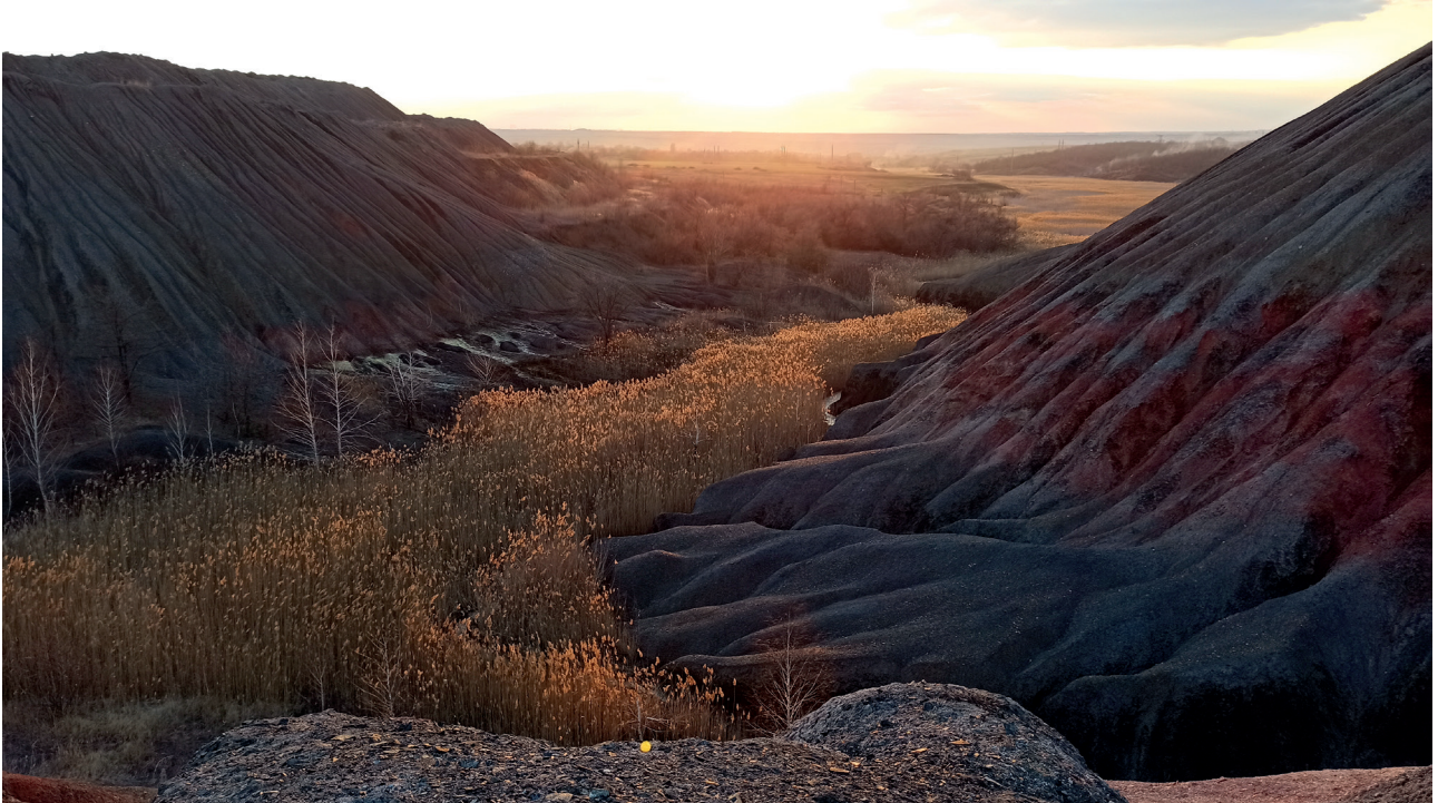
Waste heaps of the “Tsentralna” mine (Toretsk), with sulfur lakes at their base. April 9, 2021

Rights Community, as of March 1, 2020, there is confirmed data on the complete flooding of the “Klivazh” facility. The total concentration of radionuclides in the aquifers of the surrounding area, from a post at a distance of 5km from the site, was 20\text{-}34 \cdot 10^3 Bq/kg. This means that low-level radioactive waters are already entering the drinking water level. 45