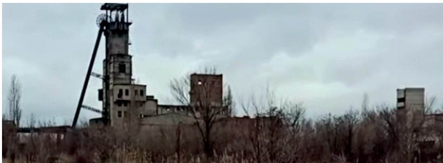
Panorama of the “Yunkom” mine