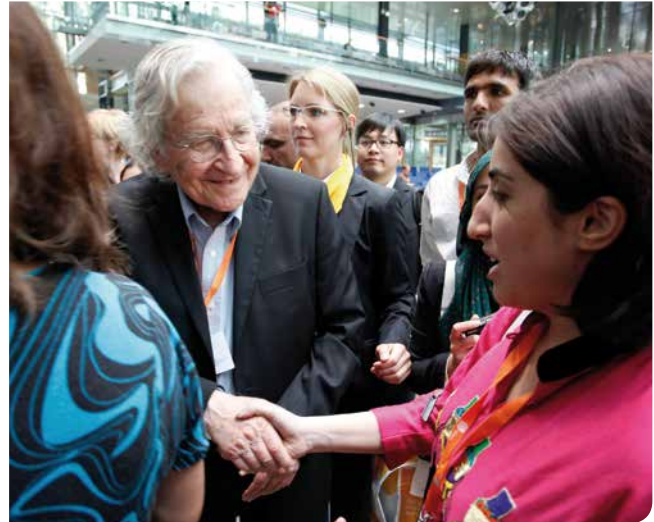
Prof. Avram Noam Chomsky Linguist, Philosopher and Political Critic, Professor (Emeritus) Massachusetts Institute of Technology, Boston, United States

It's very simple. I'd like the press to tell the truth about important things.