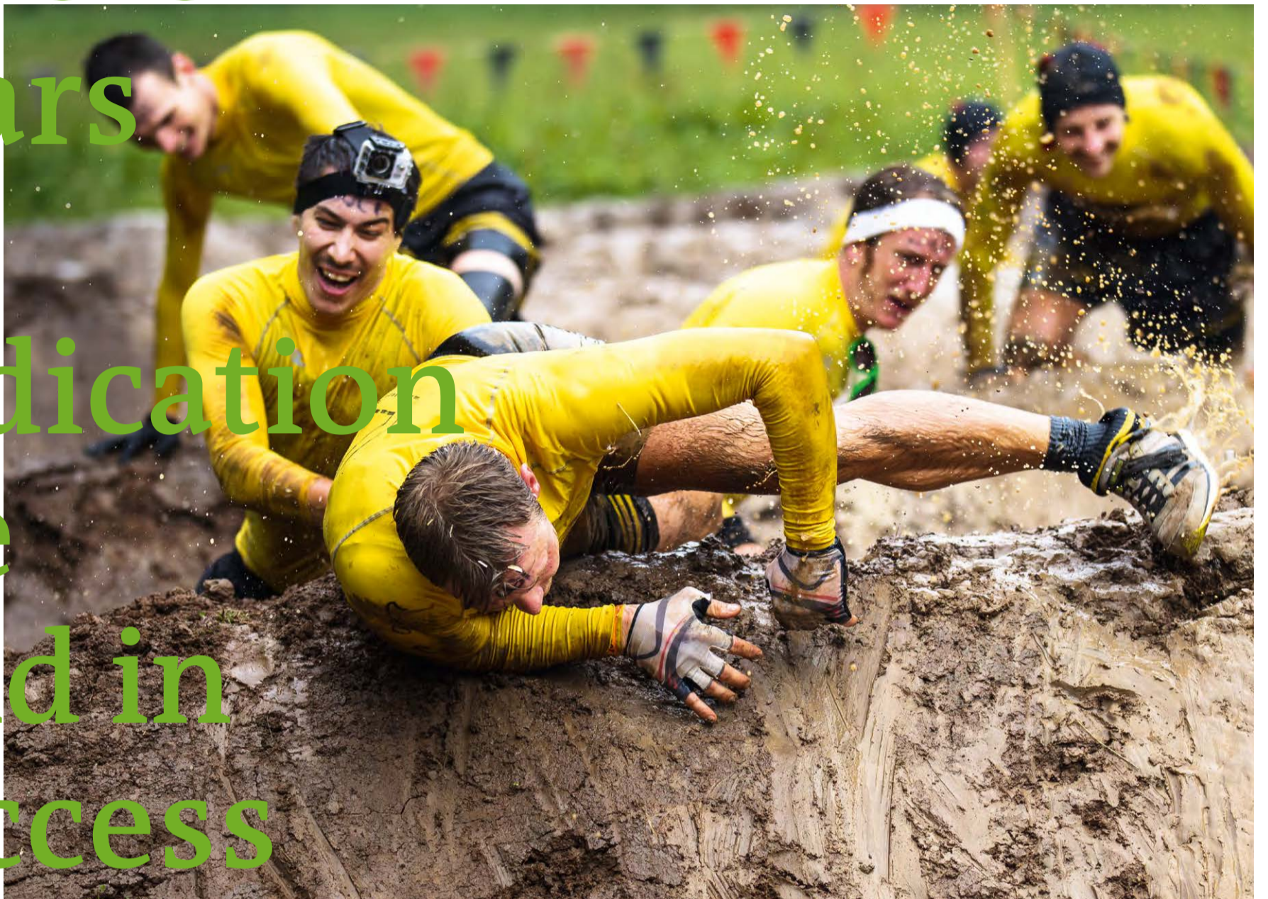
Amateur and professional athletes alike are part of the growing dynamic that can be categorized as sport – but sometimes hard to define.

The World Cup and the Olympic Games have shown us how one single event can send shockwaves around the globe. Fans create an emotional connection to teams, competitions and individual athletes. DW helps foster this connection by presenting the most interesting stories from the world of sports. From the groomed pitches of the Bundesliga to the red clay of Roland Garros and the blackened tar of Formula 1, DW is there to make sure that fans stay in the front row.