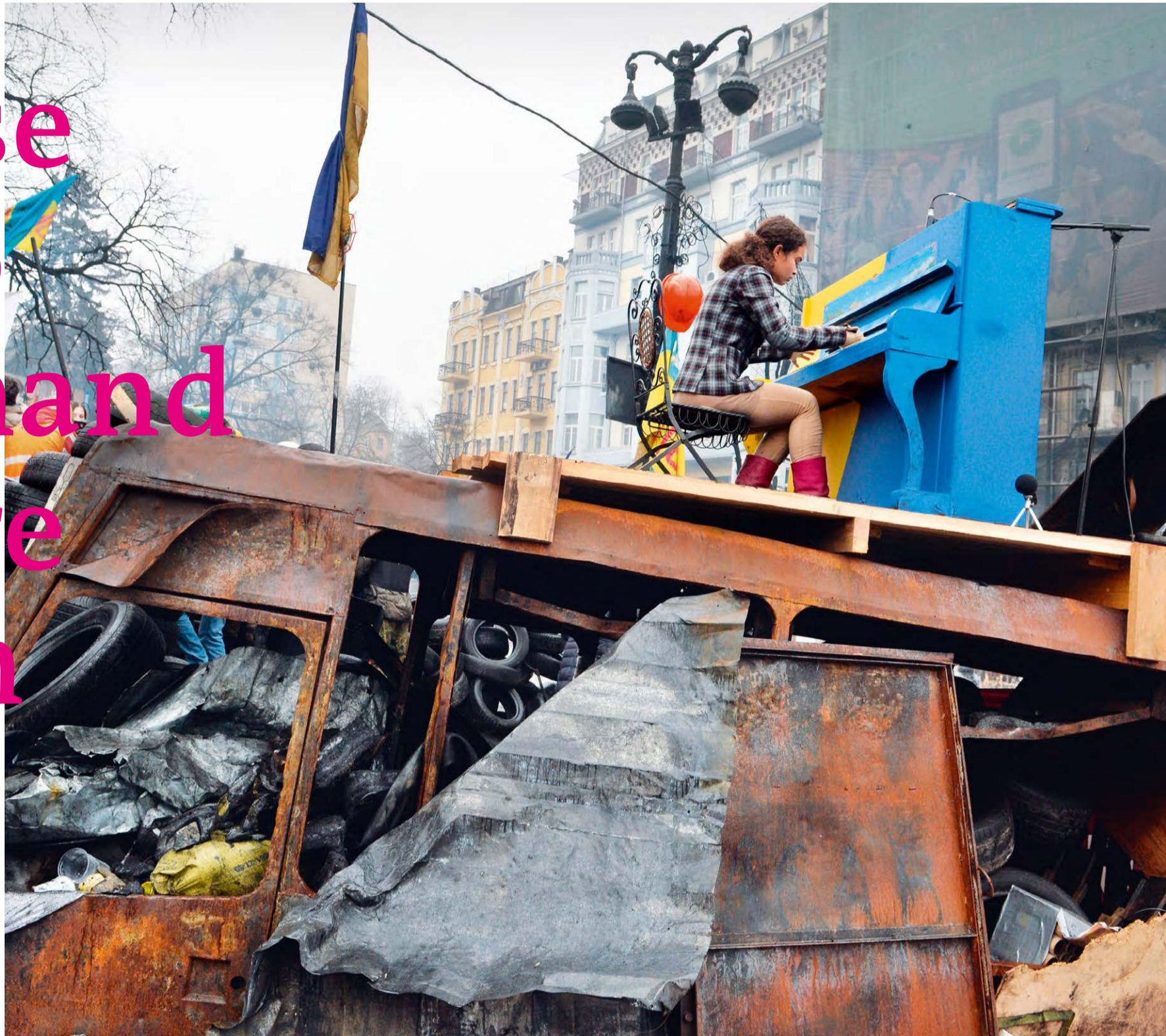
Moments of peace can be found at the most improbable places – like this Ukrainian artist playing the piano at a barricade in Kiev.