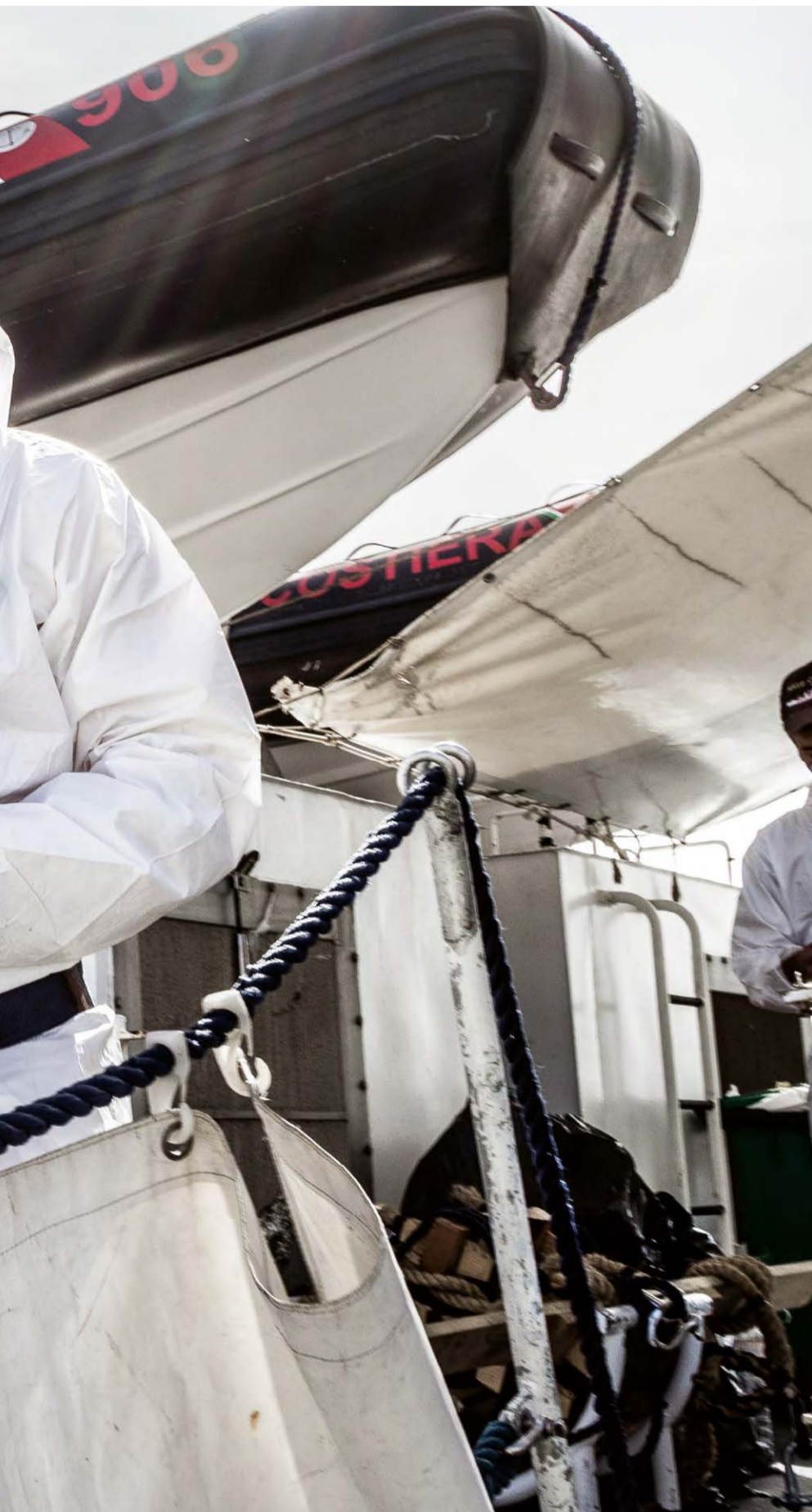
Migration remains an issue that affects millions worldwide. It has turned deadly in Europe in recent years as more and more families look for better lives elsewhere.