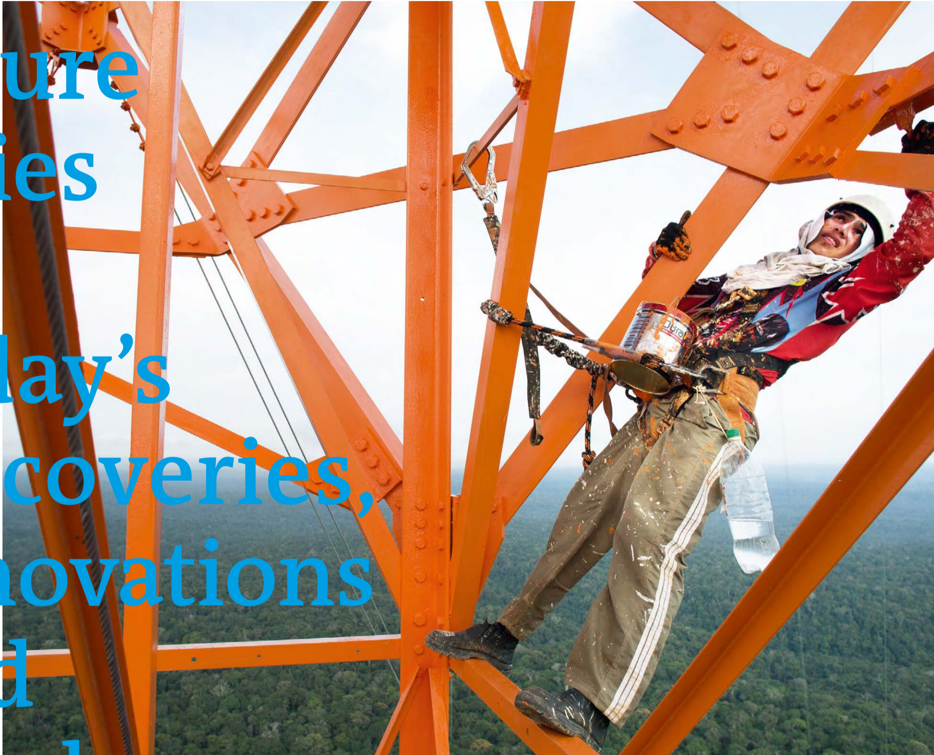
Projects like the Amazon Tall Tower Observatory will help our generation to learn and develop solutions for the future.

What are the issues and innovations that are going to determine our future? Who are the people working on solutions to regional, international and global problems? That's what DW's journalists are determined to find out. Whether it is in the rain forests of Guyana or the lab in Berlin, our journalists are exploring the world of science and technology so that users have a better grasp on many of the issues that can and eventually will affect us all.