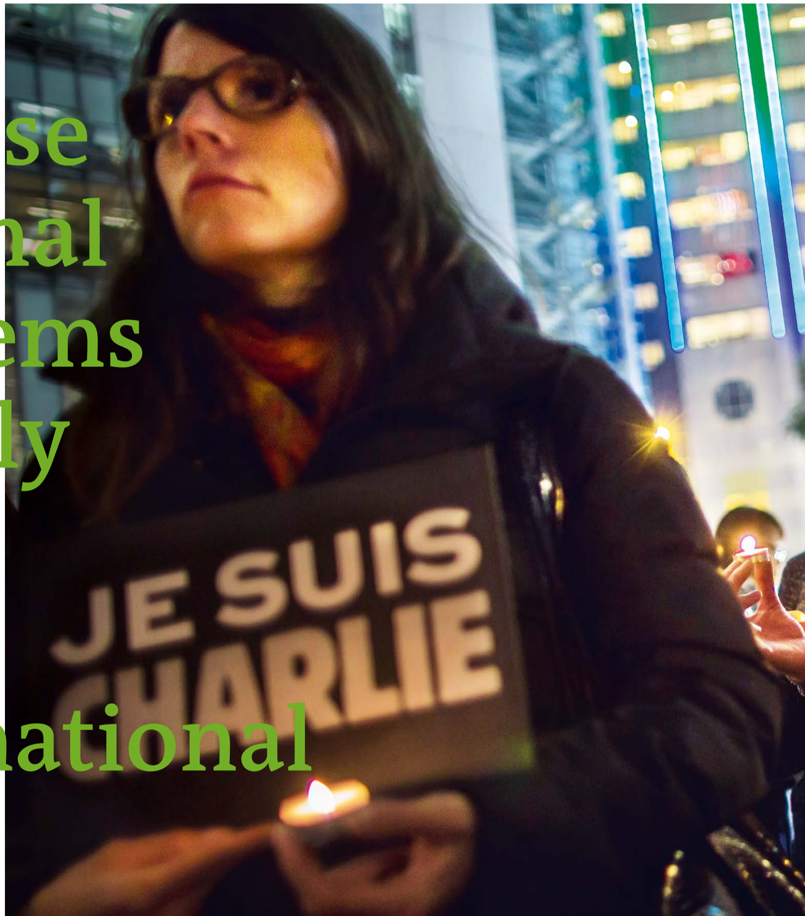
The "I am Charlie" demonstrations have shown how local events can create a chain reaction of global activism, stretching from Paris to Hong Kong within hours.

Because regional problems quickly turn into international issues