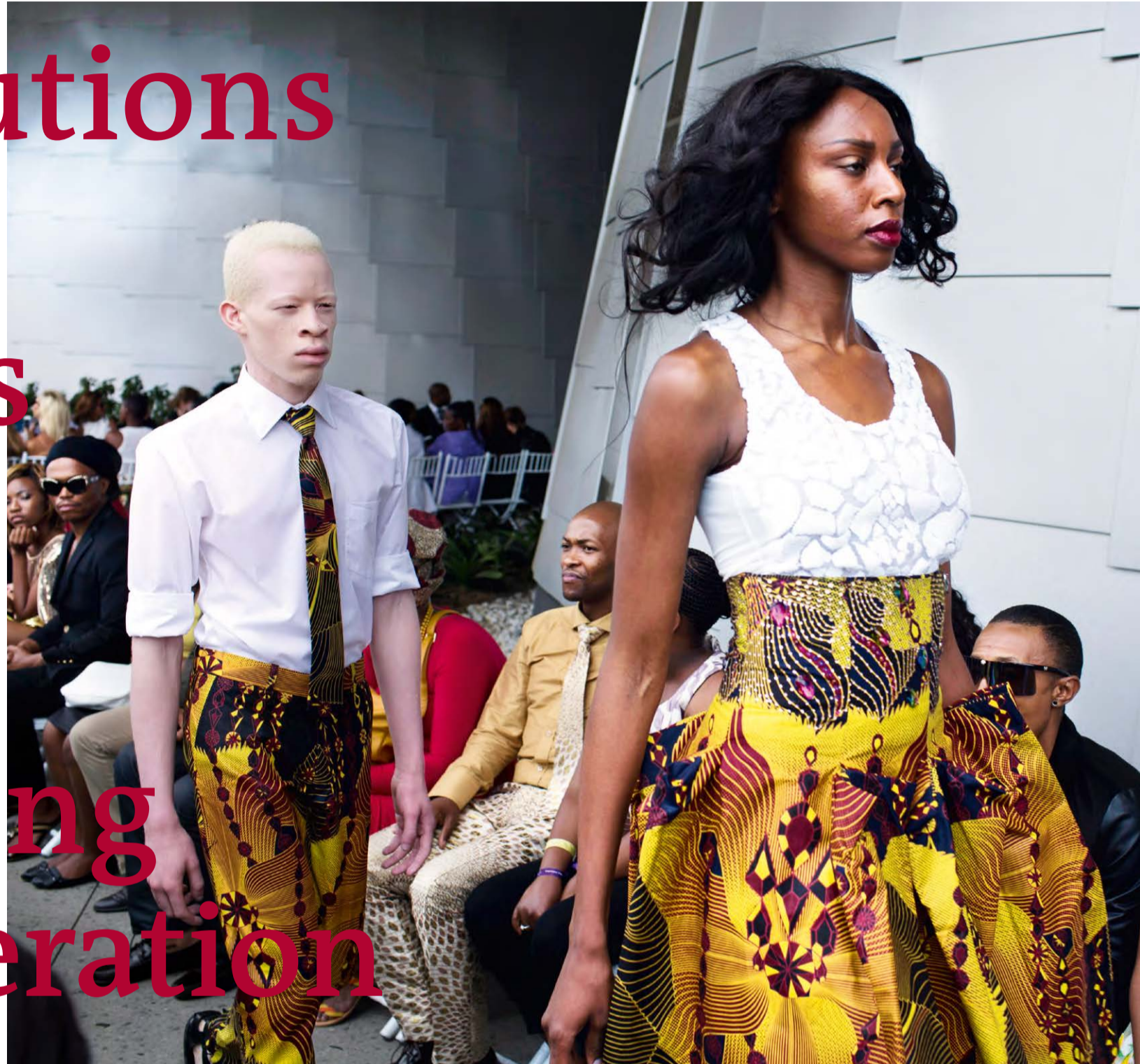
Designers from all over Africa are making a statement in fashion and there is no telling where the next inspiration for global trends will come from.

Baroque. Beethoven. Bauhaus. Each era throughout history has been shaped by the art, design and music that was consumed, critiqued and admired. These are elements that are essential to understanding how a culture lives and thrives. Germany's cultural foundation helps set the stage for intriguing stories about cultural identity and the shifting and recurring nature of design. Berlin is a city that perfectly captures the zeitgeist of modern Europe. DW's connection to Berlin and its different communities has created a starting point for insightful content that provides depth to the ideas that are shaping a generation's trends.