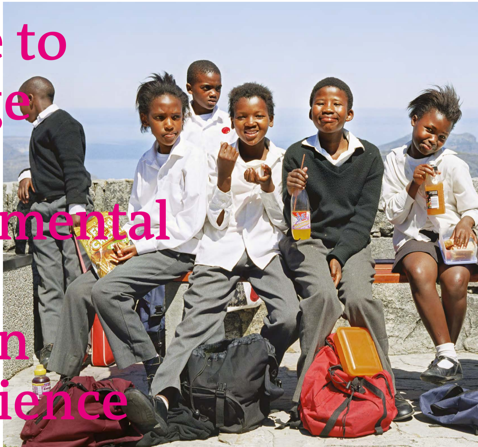
Children in Africa, like these in Cape Town, face a difficult journey to a good education.

If there is interest in a subject, there is a desire to learn – and that should be supported wherever and whenever possible. This basic principle applies to African youth with little or no access to an educational system, just as much as it applies to media managers who want to make more of their career. DW wants to turn these sparks of interest into fires of achievement – and that is being accomplished with programming and special educational projects.